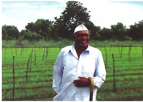
Happy farmer is at the core of all our activities.