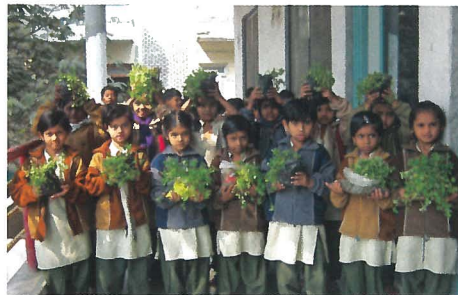
Children of Anubhūti School-2 with the 'methi' plants that they grew in their school project

The Anubhūti-1 residential school , located at our Divine Park campus is developed for preserving Indian heritage and culture in young minds, while preparing them for global competitiveness and competence. The Anubhūti-2 day school located in the centre of Jalgaon town provides free education, food and uniforms to the children of the most deprived below-the-poverty-line families. In addition, two rural schools and an agricultural college are established at the village of Wakod. Under the aegis of Bhaisaheb Sundarlal Malhara Potential Development Academy , we undertake many activities for the development of student's ability and aptitude to take on the challenges in the new world.