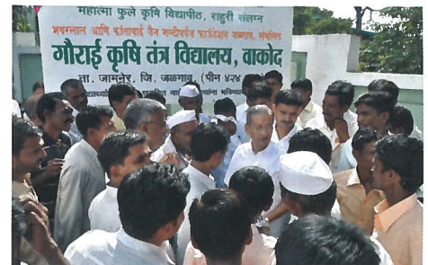
Inaugurating agriculture school at Wakod, India