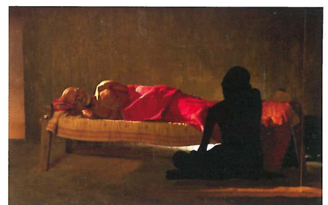
Museum : Gandhiji at Champaran, commiserating with a farmer