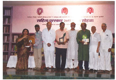
Bahinabai Literary Awards given to outstanding Marathi writers