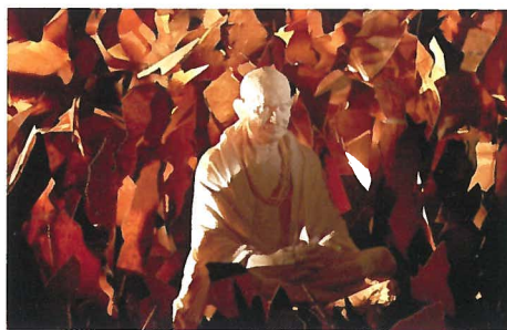
Museum : Installation showing Gandhiji at peace amidst violence