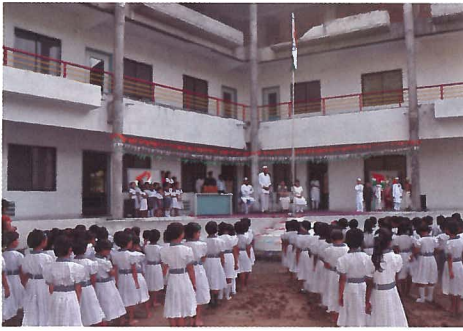
Anubhuti-2 : Totally free school for childrens of BPL families