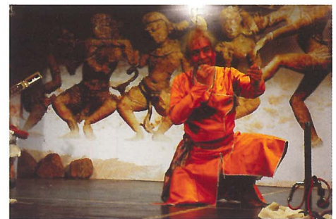
Internationally acclaimed Kathak exponent Birju Maharaj at a performance in Jalgaon